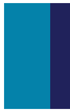
1/3 Page V