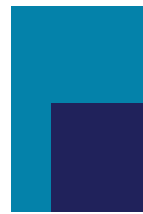
1/3 Page I